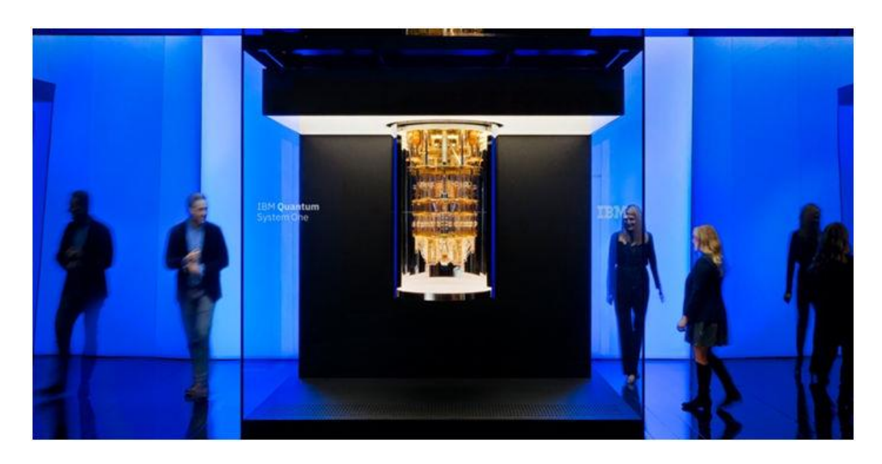
IBM Quantum System One

The M.Sc. program participates in both the "IBM Quantum Educators Program" and the "IBM Quantum Researchers Program".