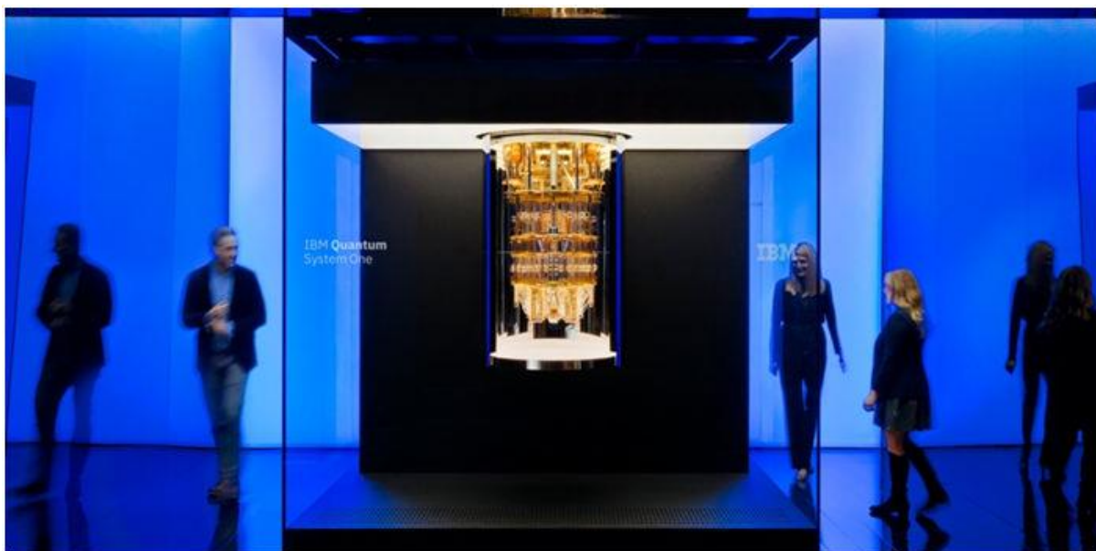
IBM Quantum System One

The M.Sc. program participates in both the "IBM Quantum Educators Program" and the "IBM Quantum Researchers Program".